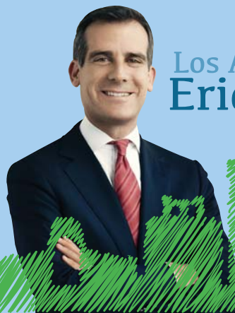
Los Angeles Mayor Eric Garcetti #LAMAYOR