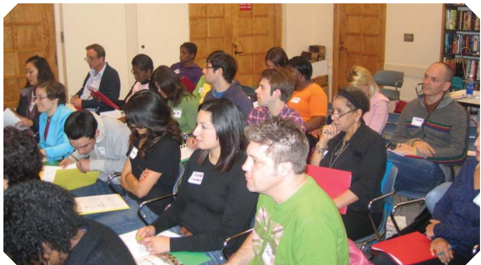
Tutor trainees listen attentively