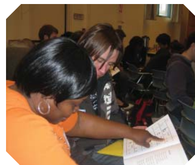
tutors in training study phonics